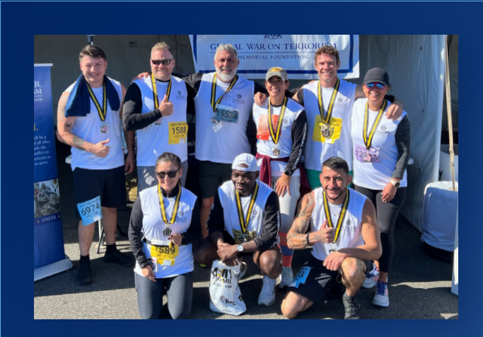
The GWOTMF was proud to represent on October 7, 2022 at the Army's annual Army Ten-Mile Race and Expo.